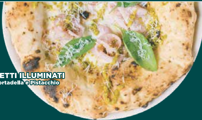
LA TETTI ILLUMINATI con Mortadella e Pistacchio

Low-temperature cooked cherry tomato, Mountains Fiordilatte, "funghetto" eggplants, topped with burrata heart, evo oil, basil.