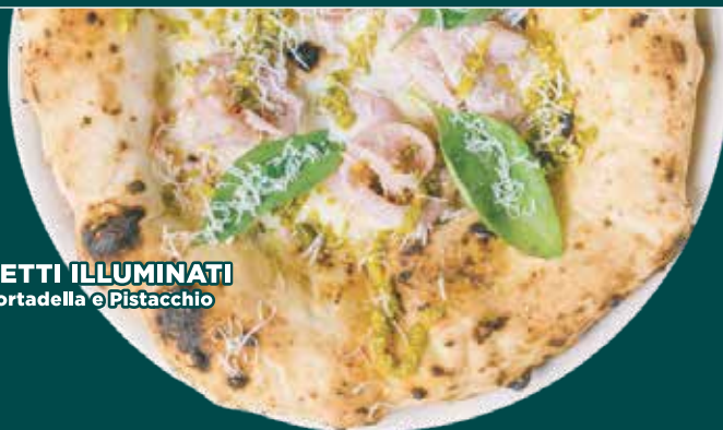
LA TETTI ILLUMINATI con Mortadella e Pistacchio

Low-temperature cooked cherry tomato, Mountains Fiordilatte, "funghetto" eggplants, topped with burrata heart, evo oil, basil.