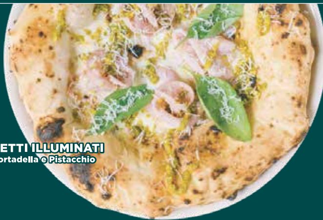
LA TETTI ILLUMINATI con Mortadella e Pistacchio

Low-temperature cooked cherry tomato, Mountains Fiordilatte, "funghetto" eggplants, topped with burrata heart, evo oil, basil.